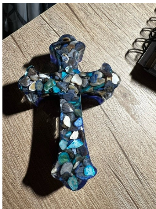
Some of Debbie's beautiful art work is pictures above.